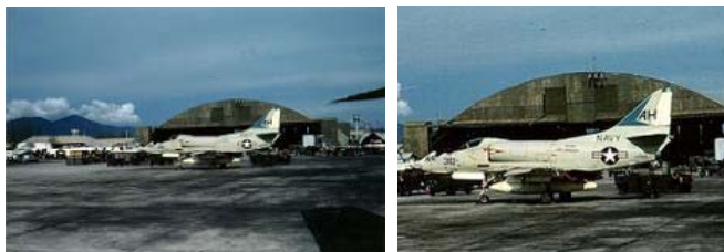
Saints 310 in DaNang with wing damage Oct 1966