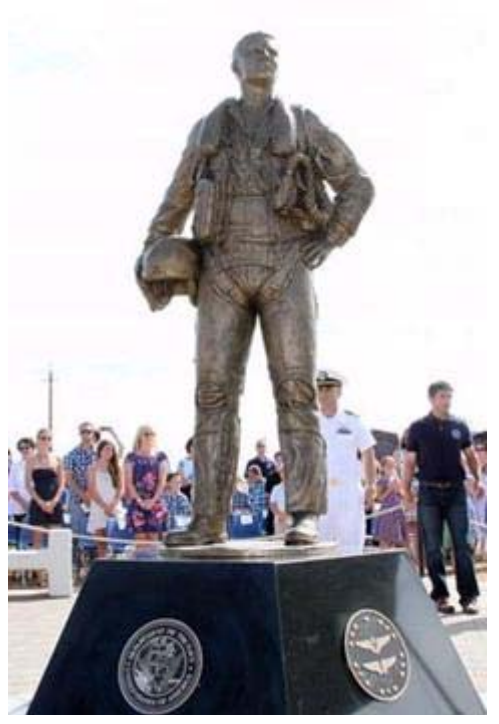
NAS Lemoore memorial