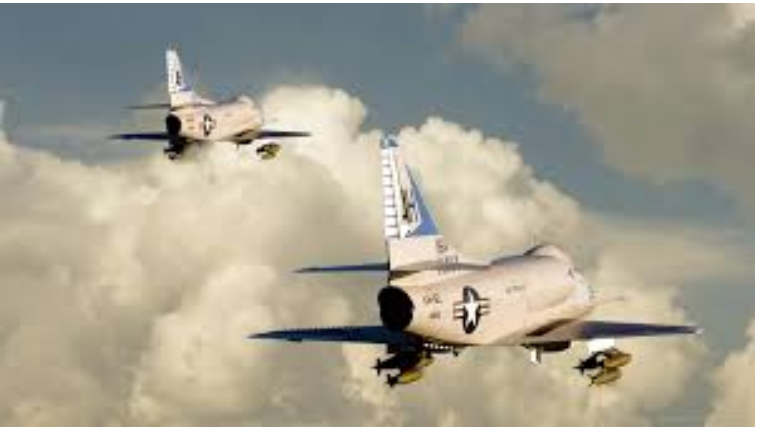
http://en.wikipedia.org/wiki/Douglas A-4 Skyhawk

Vietnam Memorial Wall Song: https://www.facebook.com/100000531380774/videos/1142596289101406/