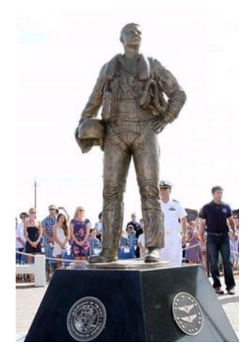
NAS Lemoore memorial