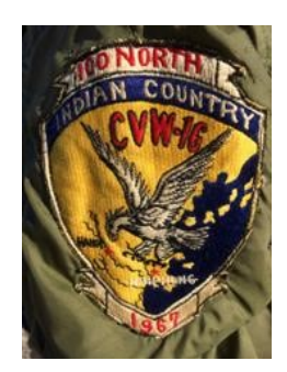
CAG-16 patch 1967

http://en.wikipedia.org/wiki/Douglas_A-4_Skyhawk