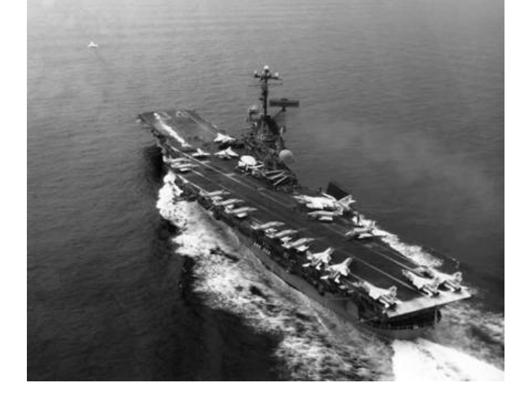
Oriskany 1966, near Vietnam