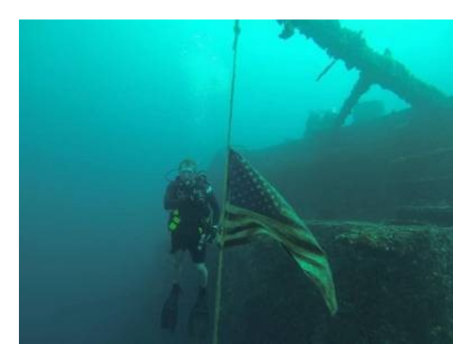
Oriskany Reef and Flag, May 2019