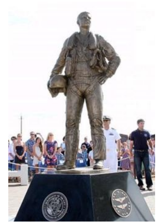
NAS Lemoore memorial