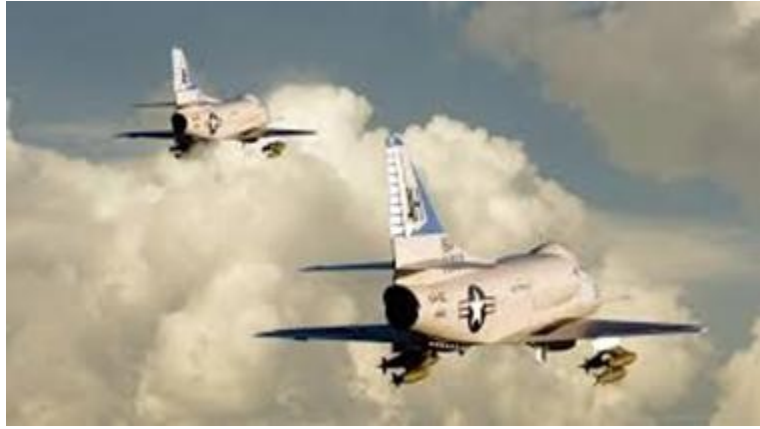
http://en.wikipedia.org/wiki/Douglas A-4 Skyhawk