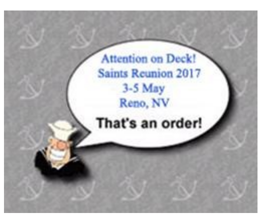
Saints and Ghostriders Reunion 2017 May 3-5, 2017