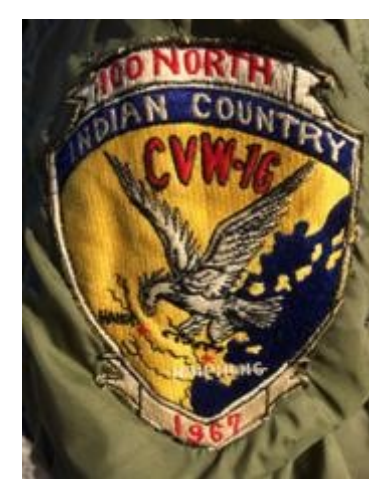
CAG-16 patch 1967