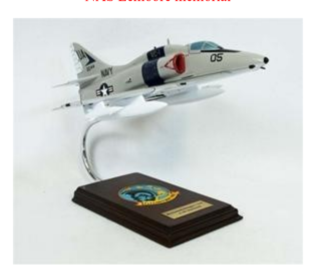
Birds of a feather... Flock Together