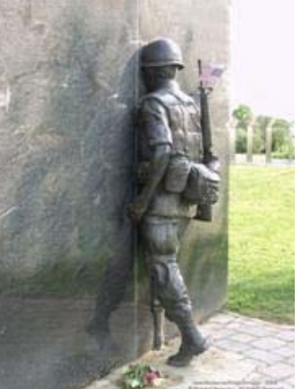
Agent Orange Troop