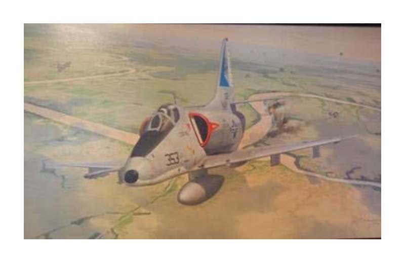
Birds of a feather... Flock Together