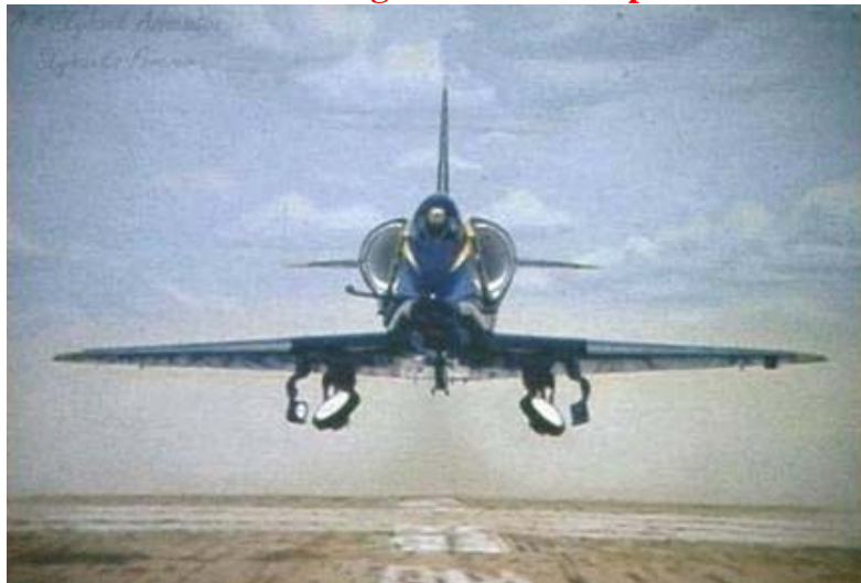
taken from my house on 9/11/12