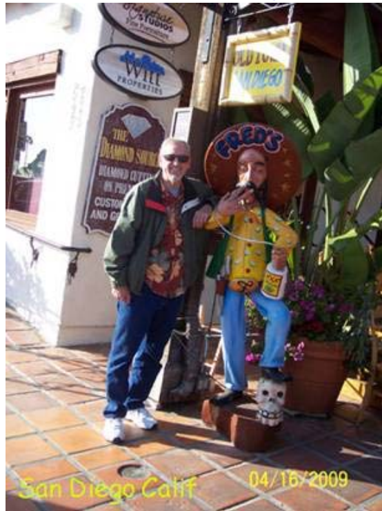
San Diego... YES!!!!