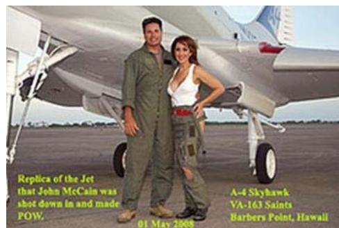
Replica of the Jet that John McCain was shot down in and made POW.