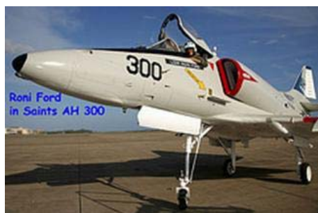
Roni Ford in Saints AH 300